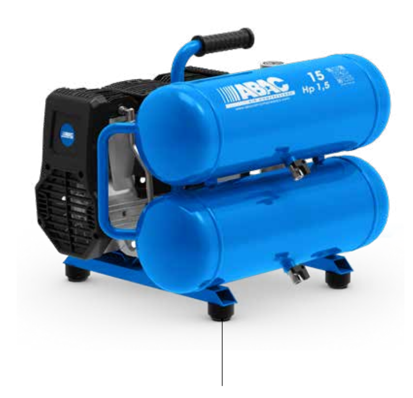
Easy to move Including wheels to easily transport your compressor