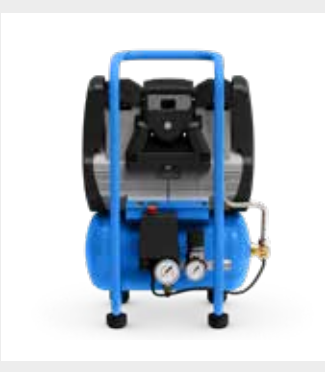
User-friendly and clear pressure gauges