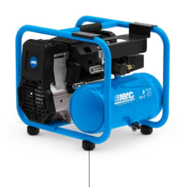
Easy to move Including wheels to easily transport your compressor