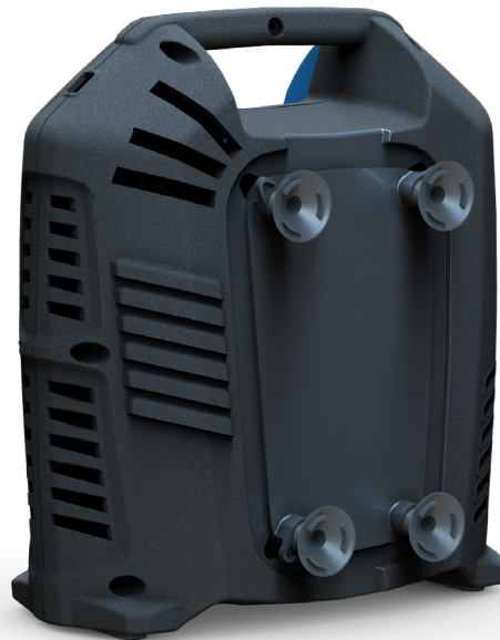
SUITCASE 0 1.5 HP

Extra small sizes are not reflecting the performances of ABAC Suitcase which offers on the contrary important air displacement of 160 l/m, 8 bar pressure and relies on 1,5 HP engine power.