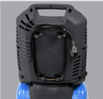
Extra shock absorber feet for horizontal use.

Ease of use and compactness are the most notable attributes behind new ABAC Suitcase air compressor.