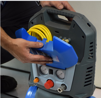
Smart flap for your tools storage. Be always ready.