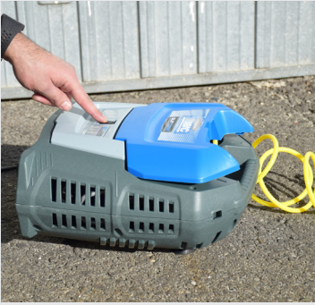
Designed to work efficiently both in vertical and horizontal position.