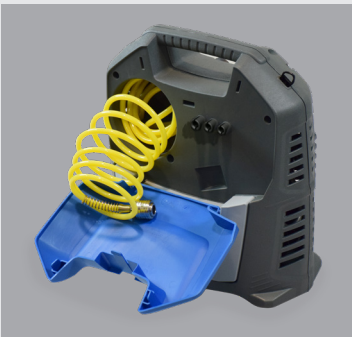
Spiral hose with universal tools mount.